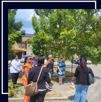
Integrated Support Creates Generational Impact

We design communities that promote wellbeing—integrating green space, healthy food access, and healthcare while advancing energy efficiency and sustainable building practices.