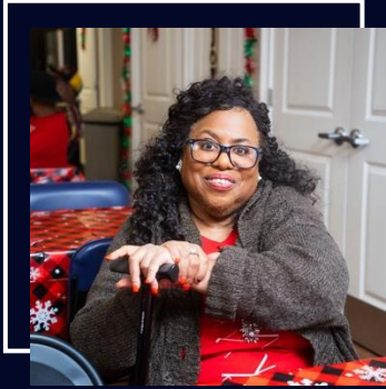
Residents Lead the Change

We prioritize meaningful resident participation through councils, surveys, and leadership opportunities—ensuring community voices inform decisions, strengthen trust, and shape outcomes that reflect lived experience.