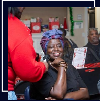
Housing and Services Create Stability

We prioritize meaningful resident participation through councils, surveys, and leadership opportunities—ensuring community voices inform decisions, strengthen trust, and shape outcomes that reflect lived experience.