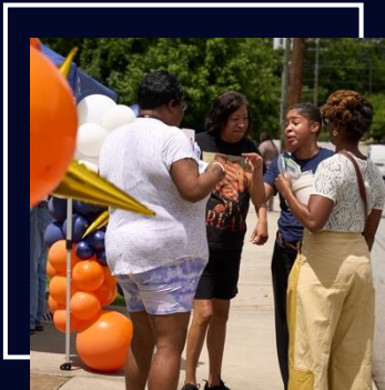
Healthy Design Strengthens Communities

We expand pathways to financial mobility through job training, employment placement, and small business support—equipping residents with the tools to increase income, build assets, and sustain long-term independence.