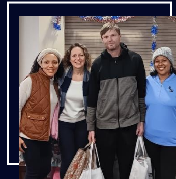
Partnerships Scale Impact

Our holistic model supports residents beyond immediate needs—improving housing stability, educational outcomes, and economic resilience to create lasting, multi-generational change.