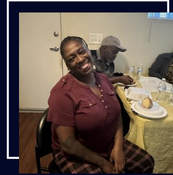
Opportunity Drives Economic Mobility

Our developments pair high-quality, affordable housing with on-site and nearby services—creating stable, connected environments where residents can access education, healthcare, food, and supportive resources within close proximity.