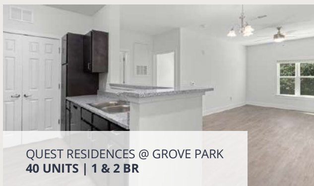
QUEST RESIDENCES @ GROVE PARK 40 UNITS | 1 & 2 BR

Affordable housing at QuestCDC is intentionally rooted in the Westside, preserving the legacy of neighborhoods like Vine City, English Avenue, Grove Park, and West Lake. We don't just build structures—we build trust. By partnering with longtime residents, local businesses, and civic organizations, we ensure development doesn't lead to displacement but to collective uplift.