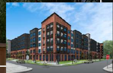
The Westside Housing Trifecta—281 Units